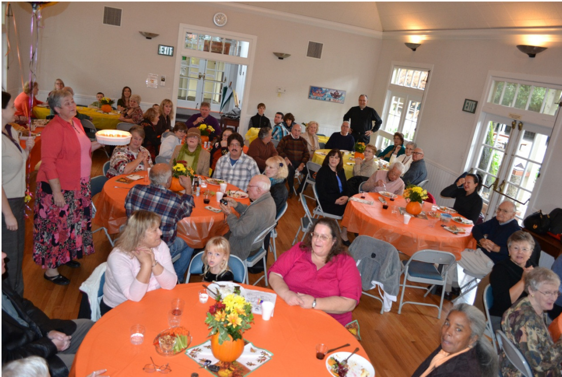
The turkey parade!