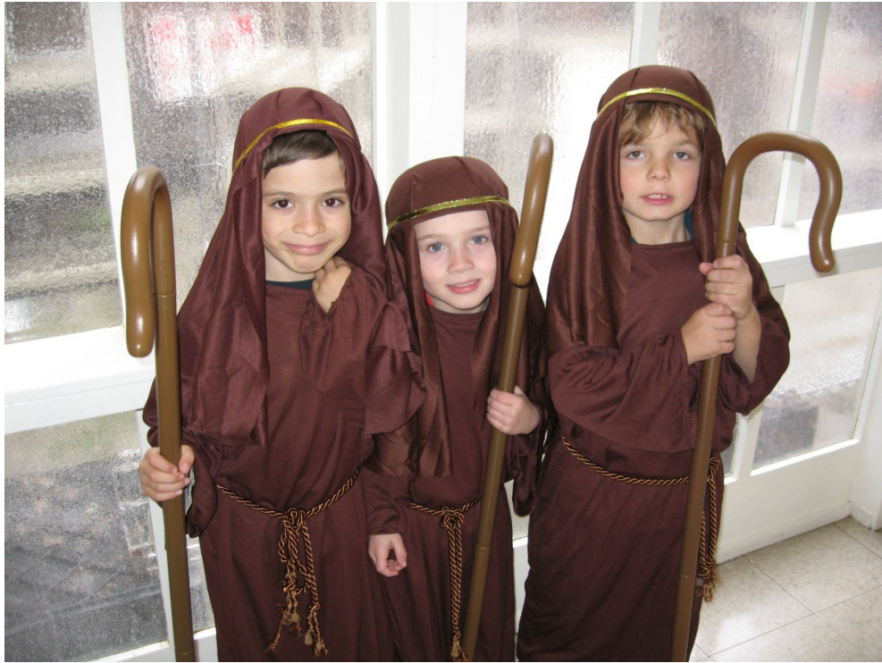
Shepherds abiding! And...